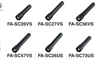
FA-SC26VS FA-SC27VS FA-SC56VS FA-SC57VS FA-SC26US FA-SC73US