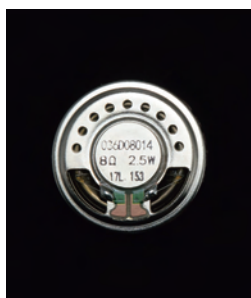
Icom custom high power handling capacity speaker