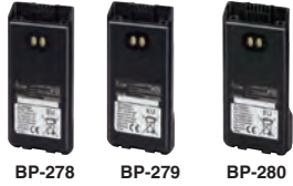
BP-278 BP-279 BP-280

BP-278: 1190 mAh (typ.), 1130 mAh (min.) rechargeable Li-ion battery. BP-279: 1570 mAh (typ.), 1485 mAh (min.) rechargeable Li-ion battery. BP-280: 2400 mAh (typ.), 2280 mAh (min.) rechargeable Li-ion battery.