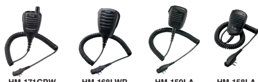
HM-171GPW HM-168LWP HM-159LA HM-158LA

HM-158LA: Compact speaker microphone with a 3.5 mm earphone jack.