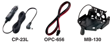
CP-23L OPC-656 MB-130

MB-130: Charger bracket for use with the BC-213.