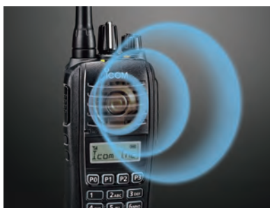
1500 mW powerful audio