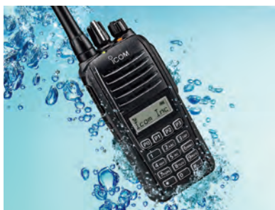
Waterproof for 30 minutes in one meter depth of water