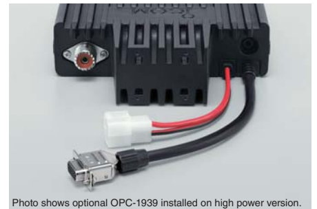
Photo shows optional OPC-1939 installed on high power version.

With the optional OPC-1939 D-SUB 15-pin ACC cable, the IC-F5023/H series can be programmed to control an operating channel from an external device (up to 16 preprogrammed channels). The ACC connector also provides an ignition sensing function, external PTT, PC command, horn honk, audio output and modulated signal input depending on programming.